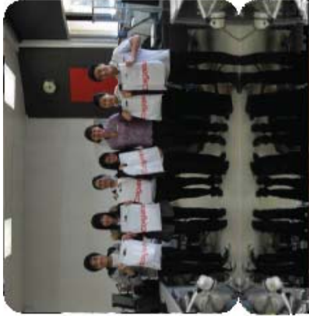
Colgate giving a module on tooth-paste under our Lunch & Learn program