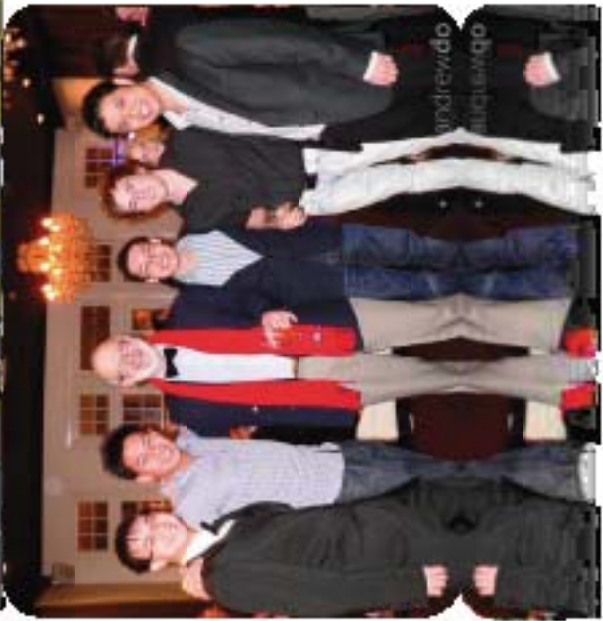
The Floscars (BOHDS formal cocktail party 2010) - students and lecturers coming together