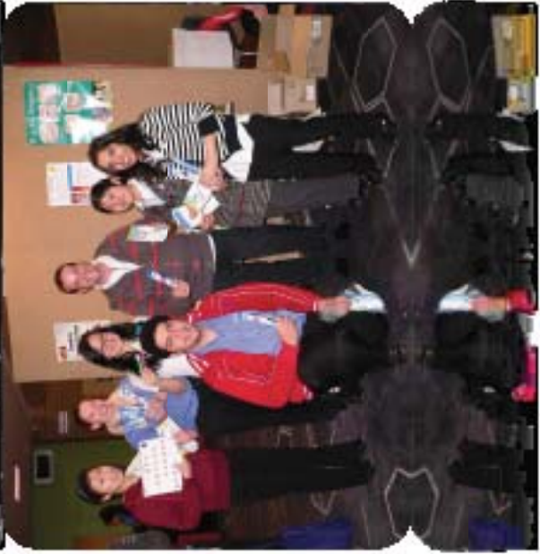
Dental Health Week 2010