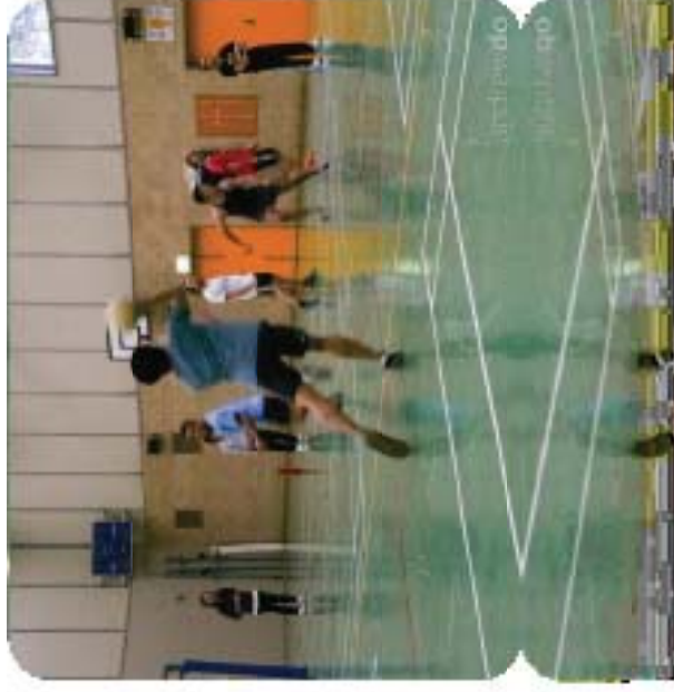
BOHDS Dodgeball event 2010